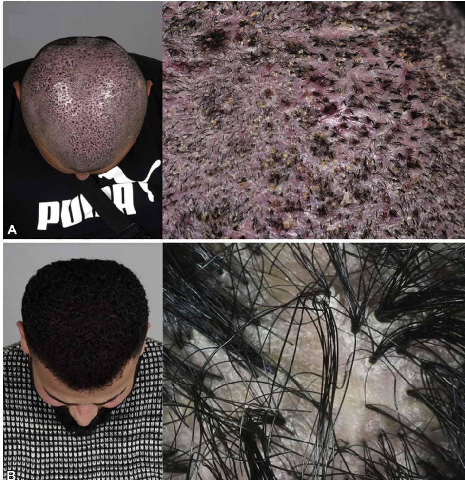
Fig 1. A , Oval patches of hair loss with erythema, follicular pustules, crusting, and hair tufts distributed along the scalp. B , Three weeks and 4 months after start of apremilast, with nearly complete regression of the inflammation.