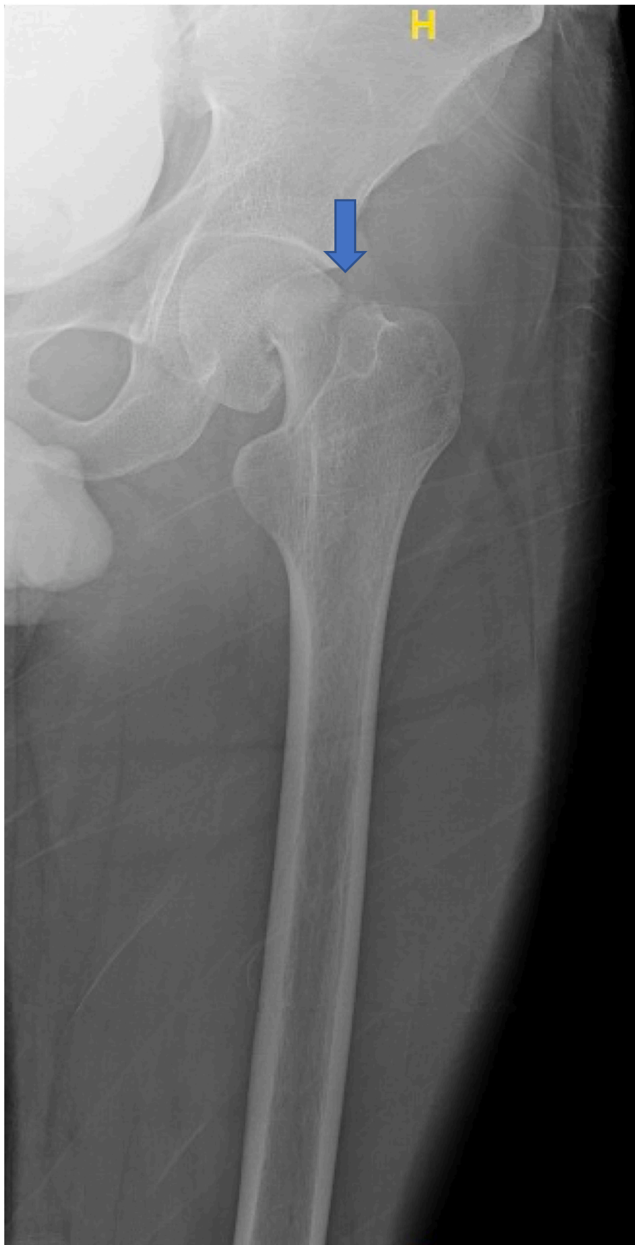
Fig. 2. Left femur X-Ray demonstrating the right femoral neck fracture. The arrow is marking the fracture.