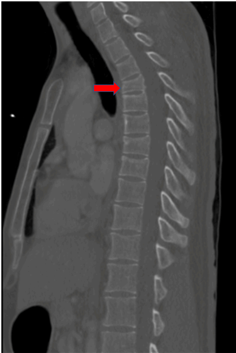
Fig. 4. CT sagittal image (Bone Window) of the Thoracic Spine Demonstrating the most significant thoracic spine fracture T4 marked by the red arrow. (For interpretation of the references to colour in this figure legend, the reader is referred to the web version of this article.)

patient did not suffer from chronic renal failure and had normal calcium levels. However, he did have low levels of serum vitamin D, which is associated with osteomalacia and osteoporosis and could have contributed to the grievous nature of the injury [25]. Vitamin D levels are currently defined into three categories: sufficiency defined as a 25(OH)D concentration greater than 20 ng/mL, insufficiency defined as a 25(OH)D concentration of 12 to 20 ng/mL and, deficiency defined as a 25(OH)D level less than 12 ng/mL [24]. Our patient was on the low end of vitamin D insufficiency with a 25(OH)D concentration of 13.6. The appearance of clinical symptoms in the setting of hypovitaminosis D depends on severity and duration of the hypovitaminosis [26]. While there have been associations of hypovitaminosis D with fractures; the asymptomatic presentation of our patient's hypovitaminosis and his young age