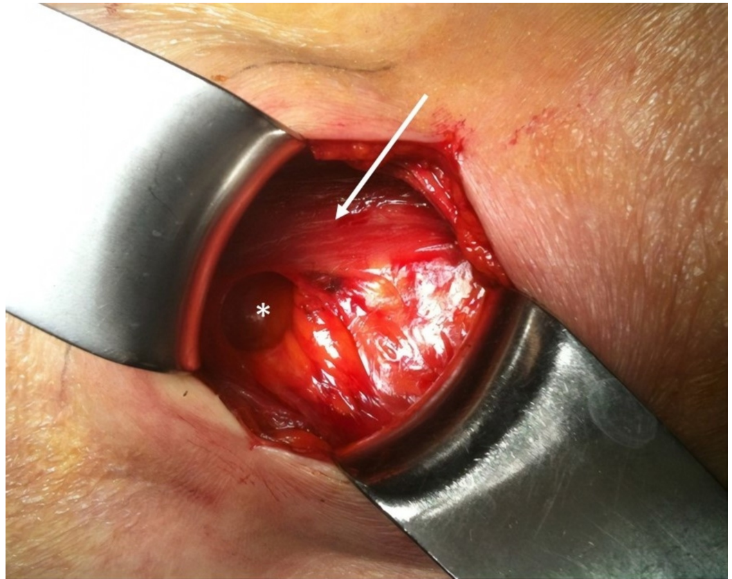
FIGURE 1: Intraoperative picture showing the defect after reduction of the hernia sac

White star: hernia defect. White arrow: erector spinae muscle.