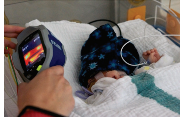
FIGURE 1: Infrared analytic measurement setup.

2.3. Thermography. Before laser acupuncture application, as well as 1 min, 5 min, and 10 min after, respectively, thermographic pictures of both the left and right hands were taken by means of a thermal camera (Flir i5, Flir Systems Inc., Portland, USA). Subsequently, the warmest spot was identified and reidentified and compared in the course of time.