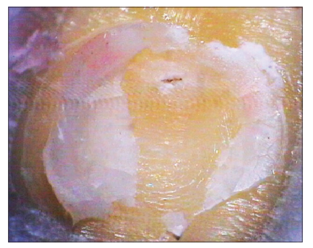
Figure 2: Mix failure of resin-modified glass ionomer sample bonded to dentin bonding surface.