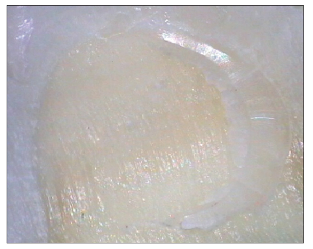
Figure 1: Mix failure of resin-modified glass ionomer sample bonded to dentin bonding surface.