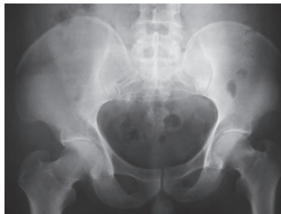
Figure 3. Postoperative pelvic X-ray results of a patient (case 1) with bladder diverticulum accompanied by bladder calculus.

Surgical methods. Under epidural anesthesia, the modified lithotomy position (head elevation, 15°) was used for surgery. The nephrostomy bag was fixed at the pubis position. The stones were not successfully removed by transurethral ureteroscopic lithotripsy, so percutaneous cystostomy was performed. After filling the bladder with saline, an 18G renal puncture needle was used to puncture the bladder 1-2 cm above the pubic symphysis. The puncture needle core then was drawn, leading to the appearance of a flow of urine, and a zebra guidewire was then inserted. A skin incision of 0.5-0.6 cm was made along the puncture needle and the fascial dilator was then used to gradually expand the incision to F18 (F22 for stones too large for F18) along the guidewire. The Peel-Away sheath was positioned to construct a stone removal passage. The Wolf 8/9.8 F ureteral endoscope was placed in the diverticulum