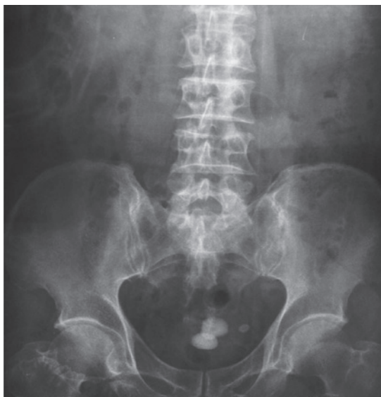
Figure 1. Preoperative KUB of a patient (case 1) with bladder diverticulum accompanied by bladder calculus. KUB, kidney, ureter and bladder X-ray.