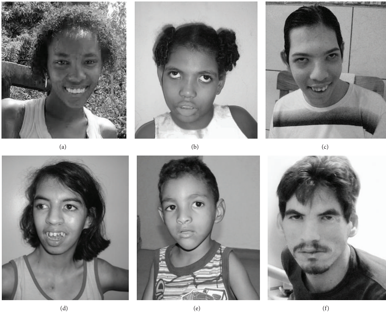
FIGURE 1: Facial features of the six patients with 5p deletion. ((a)–(c)) Patient 1, at the age of 20 years*; Patient 2, at the age of 7 years*; and Patient 3, at the age of 15 years*. ((d)–(f)) Patient 4, at the age of 15 years*; Patient 5, at the age of 6 years*; and Patient 8, at the age of 38 years*. * age in years at the time of the picture.

speech. They were also able to perform daily activities, such as dressing, combing their hair, and eating. They could not read or write, although Patient 1 had learned how to write her name. Patients 2, 3, and 6 presented with the most significant behavioral problems, including hyperactivity, repetitive movements, irritability, attachment to objects, self-mutilation (putting a hand into the throat or biting or scratching themselves), and difficulty in interacting with peers. Their intellectual disability (ID) levels, reflecting their behavioral phenotypes, ranged from 3.5 to 7.0 (Table 2).