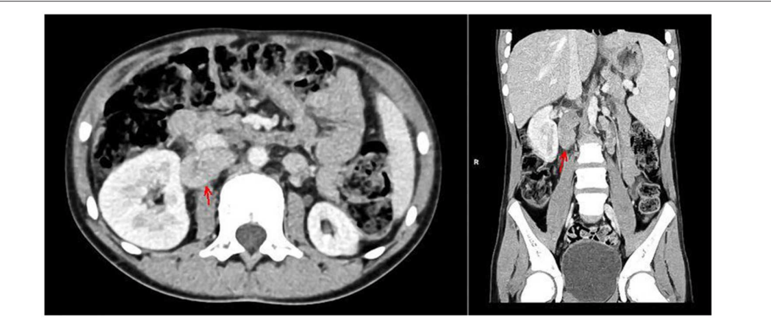
FIGURE 2 | CT of the abdomen with contrast medium, arterial phase, axial, and coronal views. Hypodense foci in the II and VIII segments of the liver, enlarged spleen, ca. 14 cm long with nonhomogenous attenuation, hypoplastic left kidney, lymphadenopathy of lymph nodes in the regions of the head of the pancreas, portal vein, right renal hilum, inferior vena cava (marked with arrows), and retroperitoneal, iliac and aortic lymph nodes, forming a mass 8.5 cm long.

In the patient studied, in whom a novel, heterozygous de novo p.Cys81Tyr mutation in the CDC42 gene was identified for the first time, a marked complexity of the clinical phenotype is observable, characterized by syndromic features, neurodevelopmental delay, immunodeficiency, autoinflammation, hemophagocytic lymphohistiocytosis, and malignant lymphoproliferation. The clinical phenotype of patients with a CDC42 gene mutation and the triad of recognizable symptoms, such as macrothrombocytopenia, developmental delay, and distinctive facial features, has been initially described by Takenouchi and Kosaki in 2015 (3). It is worth noting that the initially reported patient with the Takenouchi-Kosaki syndrome and the p.Tyr64Cys mutation did not present with the diverseness of clinical manifestations