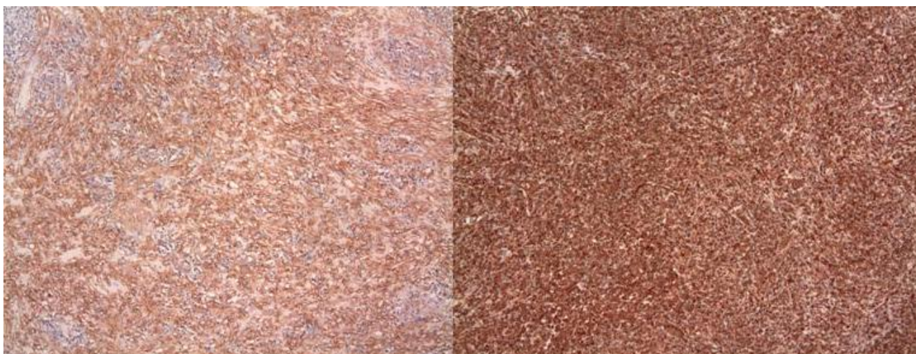
Figure 2 (Immunostains) – Immunostaining showing spindle myoepithelial cells positive for smooth muscle actin and vimentin.

Patients with IMT can present with fever, night sweats, weight loss, malaise or abnormal laboratory parameters such as elevated ESR (erythrocyte sedimentation rate), anemia, leukocytosis and site specific symptoms [15]. However patients with IMT of epididymis rarely present with above symptoms but most commonly with a palpable mass of variable duration ranging from 3 weeks to 5 years [2,4]. The mass is clinically often indistinguishable from the testis. One patient described in the literature, clinically had multiple [5] extra testicular masses, with 3