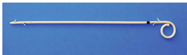
► Fig. 1 EUS-PD dedicated plastic stent.

Stent exchange was planned every 3 to 4 months during the year after initial stent placement unless spontaneous dislodgement occurred. Patients who did not want to retain the stent had their stent removed completely. In patients with surgically altered anatomy who opted for regular stent exchange, the stent was continuously exchanged every 3 to 4 months. In pa-