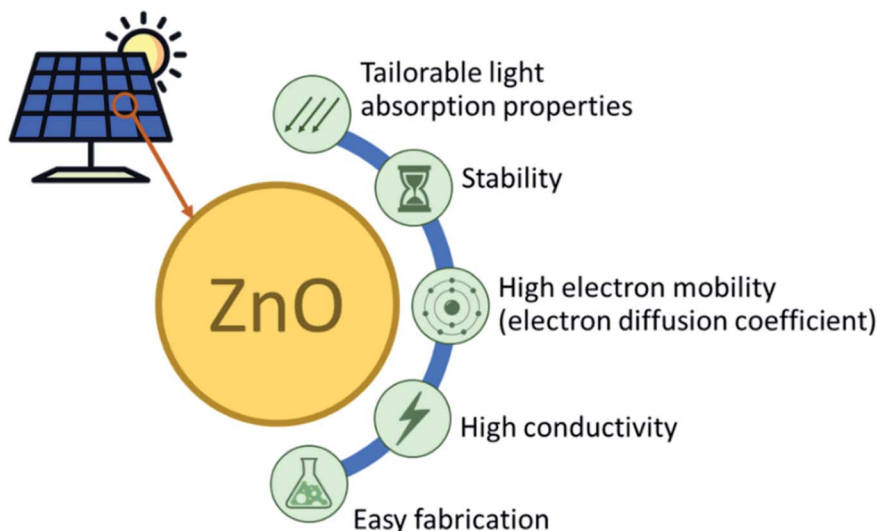
Fig. 1 The merits of ZnO for solar cell application.

have made ZnO widely applied in many areas, such as sensors, surface coating, porous ceramics, photodetectors, nanopiezoelectric, and supercapacitors, in addition to solar cells. There are also many available methods to prepare ZnO nano-materials from different pathways (biological/physical/chemical), such as green synthesis using microorganisms, hydrothermal, sol-gel, electrochemistry, inkjet printing, atomic layer deposition, and sputtering technique.