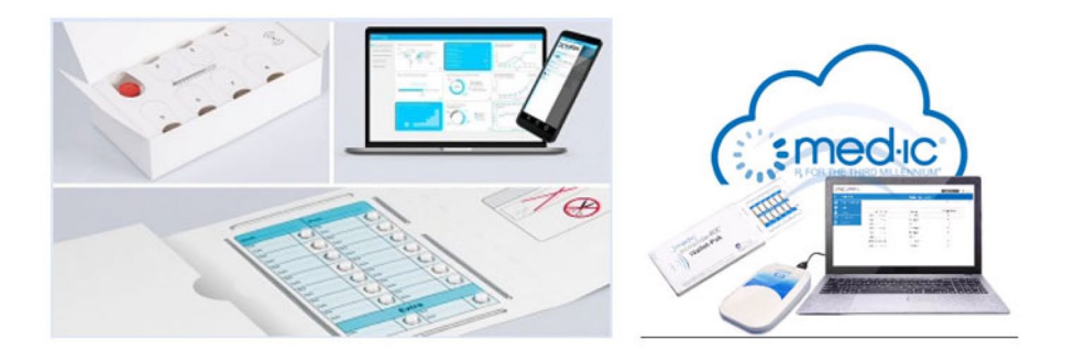
Figure 3. Schreiner MediPharm (left) versus Med-ic ECM (right). Schematic of the electronic blister pack system showing tablets pushed out from blister pack (equipped with radio frequency identification tag that records medication type, extraction time, specific cavity) and exportation of data via smartphone/reader for provider adherence analysis and follow-up.

Overall median adherence was 94% and 98% daily and weekly, respectively, compared with self-reported adherence which was 99%. Ninety-seven percent (n=100) completed treatment at 12 weeks with SVR of 94% (97 of 103 (95% CI: 88–98%)).<sup>5,32</sup> Among 81 reports of non-adherence during therapy, reasons for non-adherence