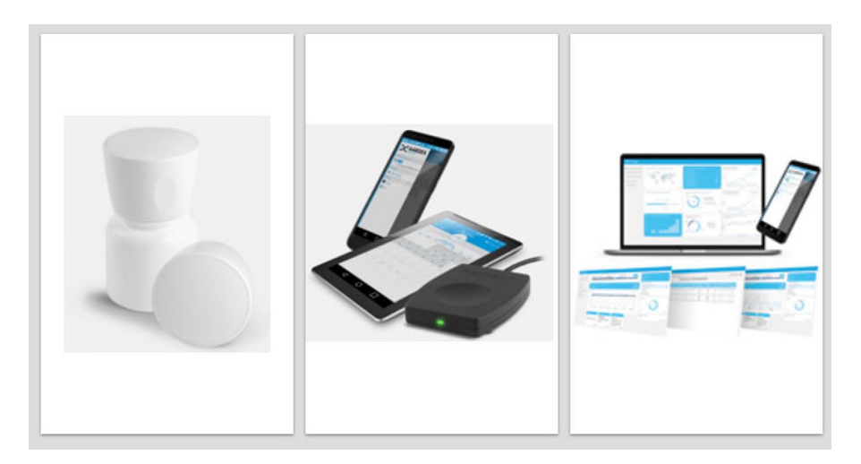
Figure 2. Schematic of the Medication Event Monitoring System (Electronic MEMS Caps) consisting of medication bottle equipped with an electronic chip cap (left), and the reader (center) for patients to download stored data that are exported to the software for visualization and analysis of adherence patterns by the provider (right).

The most common self-reported reasons for missing doses included 'feeling as if the treatment was working' (38%), 'forgetting' (35%), and 'being away from home' (32%).25 MEMS adherence decreased over time from 98.1% (weeks 0-4) to 95% (weeks 8–12) in the 12-week treatment arm. Use of marijuana, cocaine, or heroin in the 6 months before therapy or alcohol use (three drinks daily or five drinks within 2-4 h at any time) within the prior 30 days was associated with lower adherence in the 12-week, but not in the 6-week treatment arms. Self-report tended to overestimate adherence by \sim 2-4\% compared with MEMS caps (and pill counts for the three pills per day regimen), but overall adherence to HCV treatment was high in this study, showing that even individuals with perceived risk factors for non-adherence have very high adherence to HCV treatment.