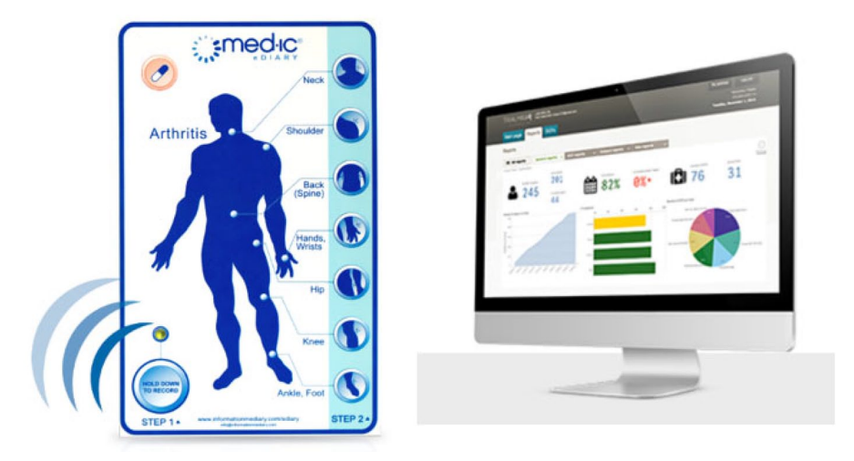
Figure 1. Schematic of electronic diary showing patient access, log drug dosing, and symptoms are logged manually (left), versus trial manager access (right), monitor, and visualize patient data. E-diary measures medication adherence, adverse effects, and provides schedule reminders.

website or an application (Figure 1).<sup>20,21</sup> E-diaries also feature alarms to remind participants to voluntarily answer pre-defined study questions, such as adverse events (AEs) and date/time entry of medication dosing. With this technology, participants complete questionnaires electronically and data are sent wirelessly. Once data are entered and accuracy confirmed by participants in the e-diaries, it cannot be changed.<sup>22</sup> Investigators can then access the stored data in designated secure cloud.