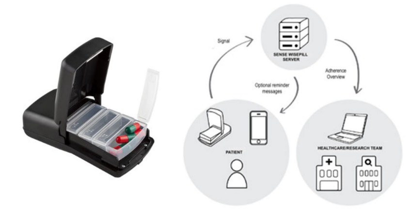
Figure 4. Schematic of a pill box – Wisepill RT2000 for medication adherence monitoring. As patients open the box, a cellular signal is sent to the web-based server, and research staff access and transfer the recorded data via a centralized server.

all remaining participants completed treatment (96.8%). Mean adherence was 39.2% in the Wisepill-only arm versus 49.9% for weekend doses in the mDOT arm (p=0.66). Only 36.4% and 60% of participants in the Wisepill-only and the mDOT arms, respectively, demonstrated >50% adherence with Wisepill (p=0.27).<sup>39</sup> However, many participants never opened their Wisepill dispensers and in 53% of visits, the dispensers were not returned (p=0.72). Therefore, replacement Wisepill dispensers were provided. Adherence by pill count was 99.5% in visits involving return of Wisepill dispensers or alternative pill containers. SVR12 was reached for 28/31 (90.3%) participants.<sup>39</sup> Among those who failed to achieve SVR, 1 terminated early, another relapsed, and the other was reinfected. Given the high rate of SVR, it is likely that participants were still taking HCV therapy, but not consistently engaging in use of the Wisepill container in this study.