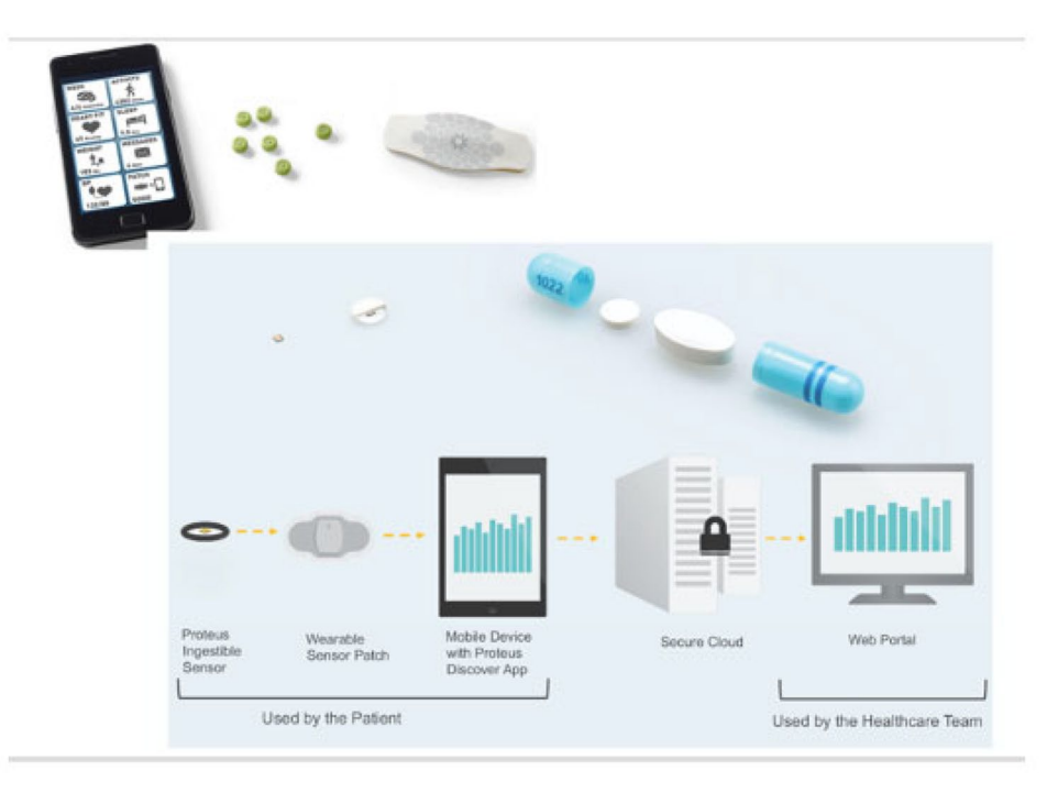
Figure 7. Proteus Discover—overview of ingestible sensor system (top) depicting sensor-co-encapsulated pill, a wearable patch, and mobile device app from which stored medication adherence, physical, physiological/ behavioral data are sent to provider web portal from the secure server once pill is ingested (bottom).

94.4% in 16 and 1 participants, respectively. Overall mean adherence was 95% (90.5%, 97.6%). Median (interquartile range (IQR)) adherence per DAA regimen were 96.1% for LDV/SOF, 95.2% for VEL/SOF, and 94.6% for GLE/PIB.<sup>49</sup> Overall, 99.1% achieved SVR, recognizing that this value is based on those with complete data and does not count non-completers as failures.