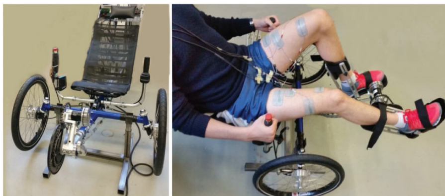
Figure 1. FES cycling test bed with motor assist. FES: functional electrical stimulation.

A recumbent tricycle (ICE Trike, ICE Ltd, UK) was modified and equipped with sensors/actuators to