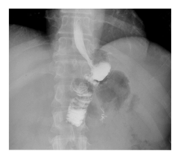
Figure 1: Post-op upper GI, was normal.