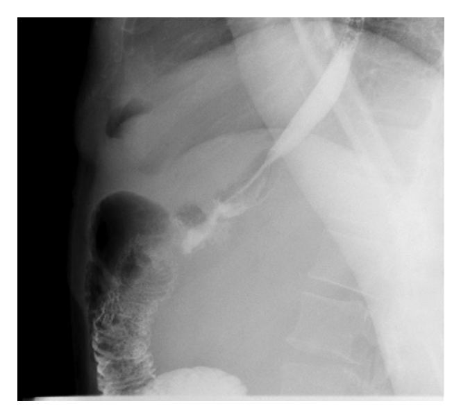
Figure 2: Post-op upper GI after resection of redundant limb.

which was normal as well. At that point patient was lost to follow up for over a year as she moved to Florida and states while in Florida had CT scan of abdomen which showed questionable internal hernia at the anastomosis. Patient was seen and evaluated in our emergency room with complaints of right sided abdominal pain with nausea and vomiting. Vital signs were stable. On physical exam, tenderness in the epigastric area. All the labs findings were unremarkable. CT scan of abdomen did not show any abnormality. However, due to possibility for an internal hernia, patient was admitted and was taken to the operating room for diagnostic laparoscopy on November 2017. She was found to have long candy cane limb. We resected excessive redundant 4 cm length of the long blind jejunal loop of gastrojejunostomy anastomosis using Endo GIA Tri-Stapler device, Intra-op EGD was performed showing 4cm gastric pouch. Post-operative course was uneventful. The patient was discharged to home on post-operative Day 4 and returned to clinic 1 week for follow up and tolerating diet and completely asymptomatic and pain free.