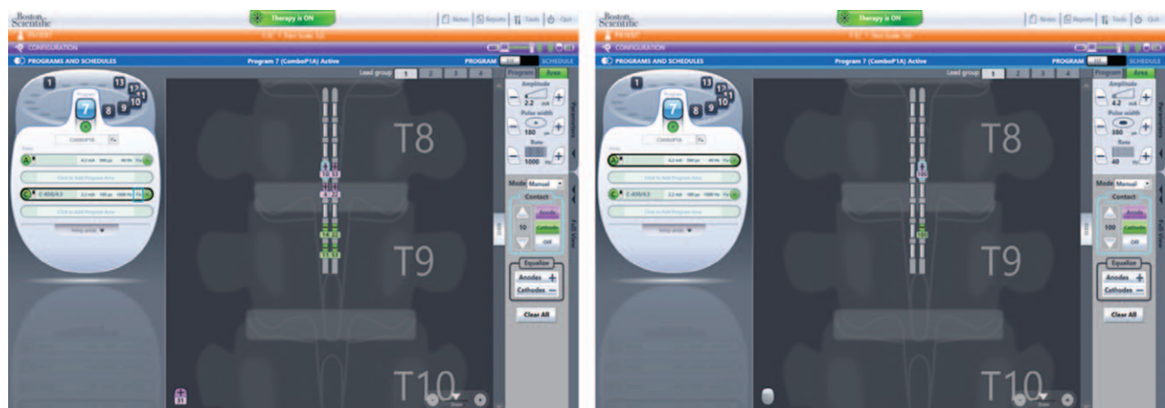
Figure 2. Spectra system programs.

The patient selected program number 7 (Fig. 2) from 16 programs provided by the Spectra system. Therapy consisted of a tonic stimulation whose paresthesia covers the entire area of pain including the lower back, pelvic region, and both legs. This program was combined simultaneously with a 1000 Hz contour high frequency tonic stimulation.