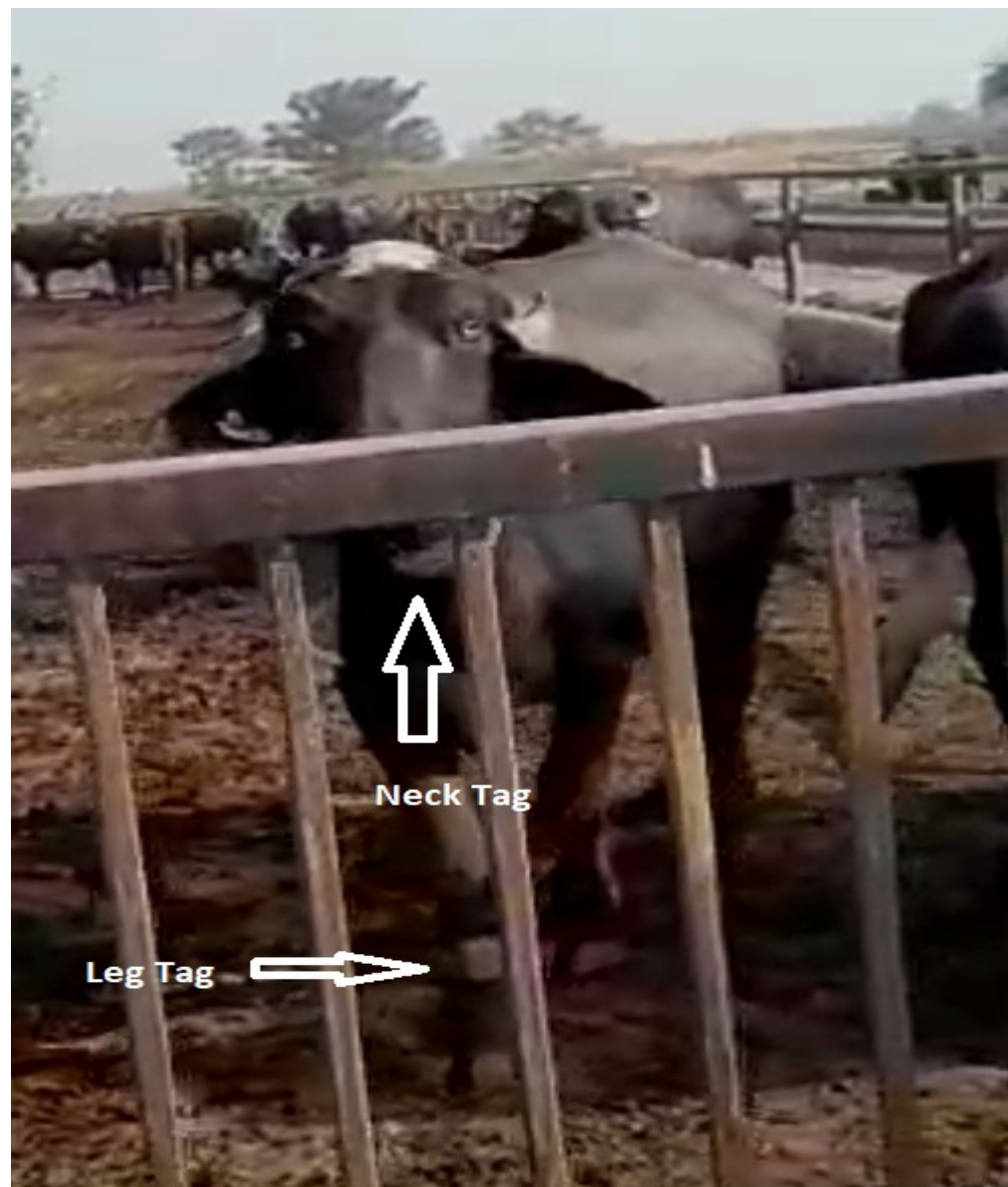
Figure 1. The black arrow shows the NEDAP neck tag, while the red arrow shows the NEDAP leg tag.

for the study trial. The NEDAP neck and leg tags were attached as instructed by the company, as shown in Figure 1.