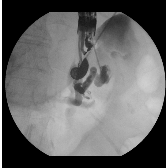
Figure 1. Left gastric vein shunt detected during endosonographic varicealography before EUS-guided endovascular therapy. EUS, endoscopic ultrasound.

Endoscopic therapy with cyanoacrylate injection is considered the first-line alternative for GV treatment and TIPS as the second alternative after failed cyanoacrylate injection or balloon