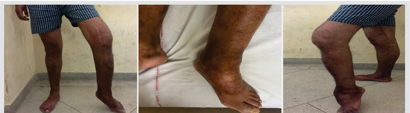
Figure 4, 5, 6: Clinical picture depicting the leg length discrepancy, knee flexion contractures, and ankle in equinus.

Melorheostosis is derived from the Greek word Melos (limb), Rhein (to flow), Ostos (bone) due to its characteristic periosteal hyperostosis giving the appearance of a flowing wax from the candle. It is also known by the various other names such as Leri's disease, candle bone diseases, and osteosis eburnisans monomelica.