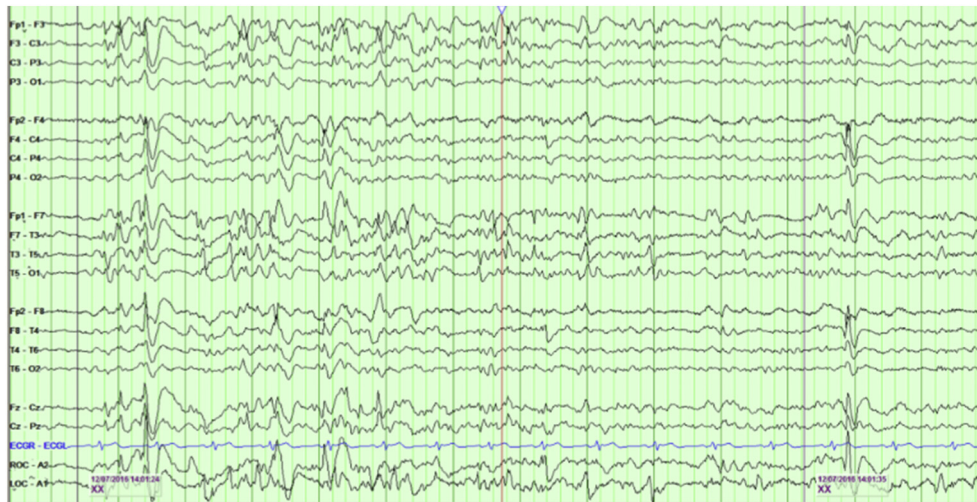
Fig. 1. This page shows the presence of bursts of generalized spike-wave in an awake sample (bipolar montage). The sample was taken during a week of frequent seizures.