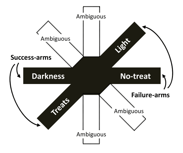
Figure 1. Overhead view of automated-maze. Rats were trained with access to the success- and failure-arms and only had access to the ambiguous-arms in the final minute of the last test. doi:10.1371/journal.pone.0083578.g001

Directly after baseline testing, we randomly assigned two-thirds of the rats (enrichment-removal, N = 40) to be housed in standard laboratory cages with continuous access to food and water but no treats, shelter, gnawing objects, or social companions, all of which are known to be effective enrichment in rats [18,19]. This environmental manipulation was implemented to induce a