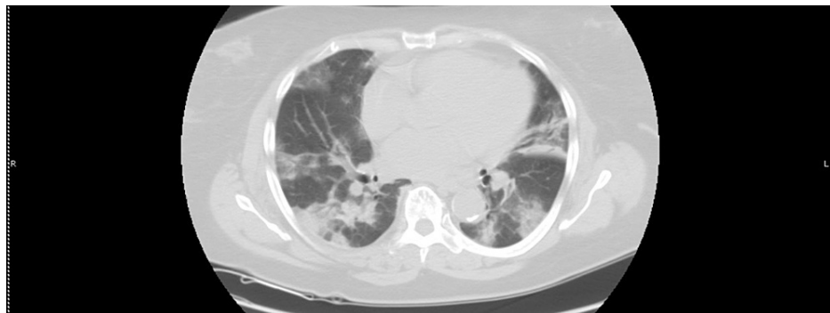
FIGURE 2: CT Chest w/o contrast image 2