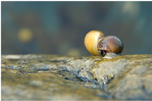
Figure 1. A copulating pair of Littorina ( Littorina saxatilis of Swedish S ecotype). The female is attached to the substratum while the male is positioned on the right-hand side of her shell, inserting his penis under her shell. doi:10.1371/journal.pone.0012005.g001

predation increases for mating pairs compared to single individuals [17]. Dislodgement by waves is an additional selective pressure for intertidal snails, as being removed from the intertidal increases risk of predation by crabs and fishes [18,19]. Risk of dislodgement is determined by the hydrodynamic drag (proportional to the cross-sectional area of the snail) and attachment strength (proportional to the foot area), and we therefore hypothesize that a copulating pair should have considerably greater risk of dislodgement because cross-sectional area is doubled with no change in attachment strength.