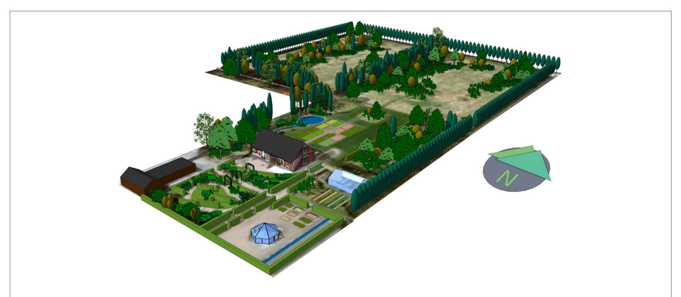
FIGURE 2 Alnarp Rehabilitation Garden, part of the Swedish University of Agricultural Sciences' research infrastructure. The garden is approximately two hectares in size and is designed with a number of garden rooms with different designs and contents. Studies of patients in the garden revealed behavioral changes associated with different types of treatments, which may be associated with release or not of oxytocin. The model of the garden is made by Gunnar Cerwén.

be strengthened (Grahn et al., 2010; Pálsdóttir et al., 2014), accelerated by an oxytocin release (Adevi et al., 2018). In particular, the physiotherapeutic treatment came to stimulate the release of oxytocin, which was marked by the behavior. Thus, the participants could find a good natural environment where they could reflect on their situation (Adevi et al., 2018).