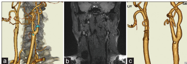
Figure 1: Preoperative three-dimensional computed tomography angiography (a) and neck magnetic resonance imaging study (b) revealed left internal carotid artery severe stenosis due to high volume plaque. Postoperative three-dimensional computed tomography angiography showed disappearance of left internal carotid artery stenosis (c)

The ORBEYE™ surgical microscope was used in this surgery, with initial onsite support by the manufacturer. Briefly, this system consists of two of the Sony's 4K (4096 × 2160 pixels) Exmor R™ CMOS image sensors, providing a high-sensitivity, low noise, and a wide color range image, which is displayed on a 55-inch monitor [Figure 2a]. The observers are allowed for active 3D vision with passive light 3D glasses [Figure 2b]. The OPMI PENTERO operative microscope (Carl Zeiss AG, Jena, Germany) was prepared as backup.