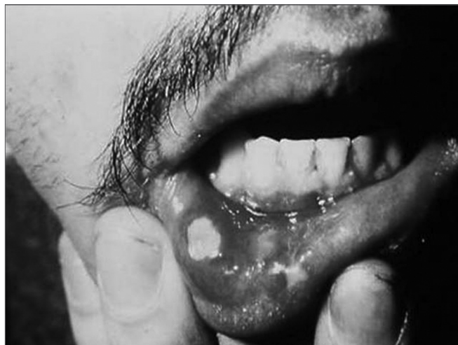
Figure 2. Aphtha major on the lower lip. Notice scar lesions

Lehner 15 and Sistig et al. 4 advocate the thesis that RAS's physiopathology is associated with a disorder in immunomodulation. These authors did not find positiveness in the direct immunofluorescence test (Dif) in patients