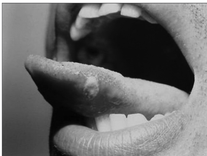
Figure 1. Aphtha minor on the tongue's lateral border

The disease may manifest itself in three different ways. The minor type is characterized by a small ulcer, measuring from three to ten millimeters in diameter, located in the non-keratinized mucosa, alone or even in large quantities in the mouth 2,3 (Figure 1). The major type is characterized by an extensive and painful ulcer, measuring more than 10 millimeters in diameter, also present in keratinized mucosa, usually alone, and can take more than 15 days to heal completely, and it may leave scars in the mucosa (Figure 2). The third type is herpes-like, characterized by numerous small ulcers that coalesce, and this is the rarest form of the disease 2,3 .