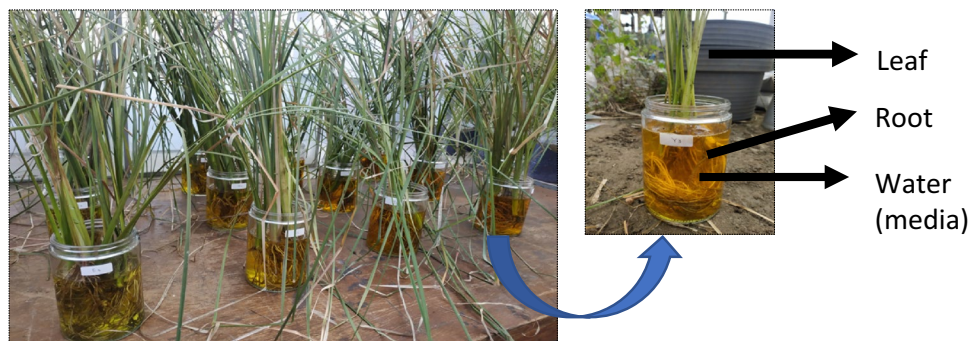
Figure 2. Sampling vetiver site.

cially using K_2Cr_2O_7 and NiSO_4 \cdot 6H_2O . Chromium concentrate solution was made with diluting 5.66 g K_2Cr_2O_7 in a 1000 mL reaction flask, while nickel standard solution was made by diluting 4.48 g NiSO_4 \cdot 6H_2O in a 1000 mL aquadest. Different levels concentration of chromium (Cr) and nickel (Ni) as artificial wastewater were made by dilution of concentrate solution.