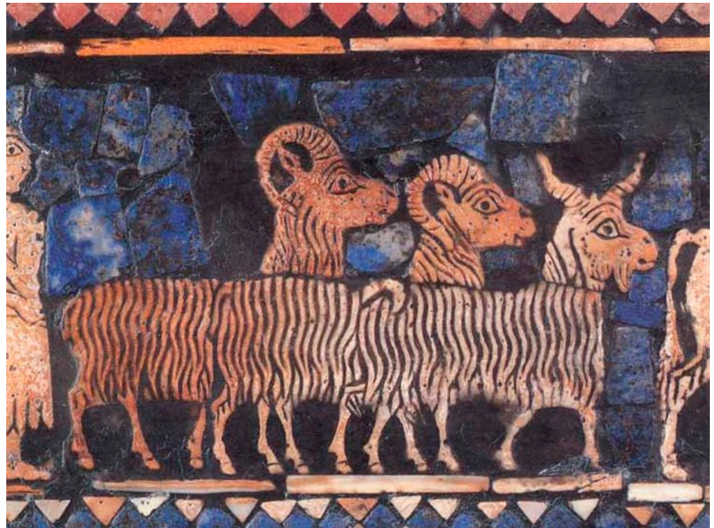
Figure 1. The Standard of Ur, a Sumerian artifact from the Early Dynastic III period c. 2500 BCE with mosaic scenes made from shell, red limestone, and lapis lazuli depicting ancient sheep and goat breeds. Photo courtesy of the British Museum (Item No. 12561001).

been fascinated by this process because it provided a succession of separate long-term hereditary experiments in which plants and animals were chosen for specific qualities [10]. Breeders, who were eyewitnesses to the processes for millennia, gathered fundamental evidence of how traits pass down from one generation to another [11]. Sheep, with their distinctive coat, milk, and meat, were particularly sought after among domesticated animals. The domestication of this mammal dates back as far as 11,000–9000 BCE in Mesopotamia with prominent ovine symbols in various civilizations [12] (Figure 1).