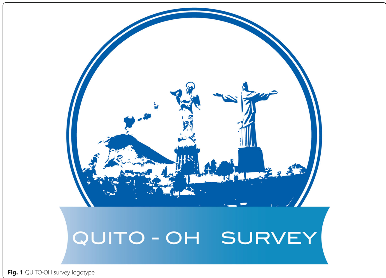
Fig. 1 QUITO-OH survey logotype

the urban area, with approximately 134,000 students and about 17,000 aged 12 years.