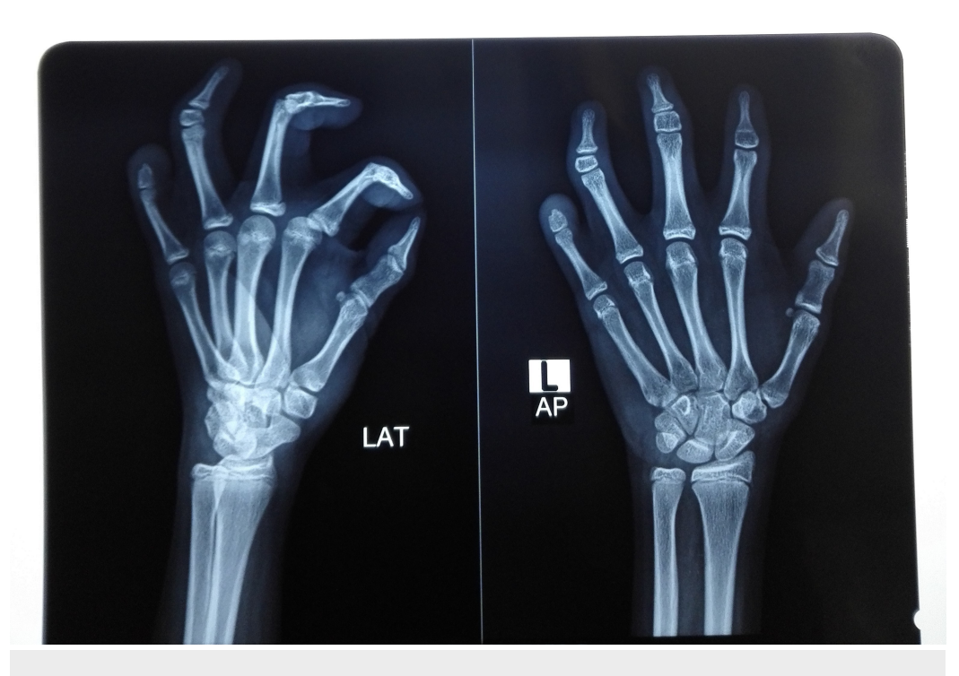
FIGURE 5: X-ray images of the skeletal abnormalities