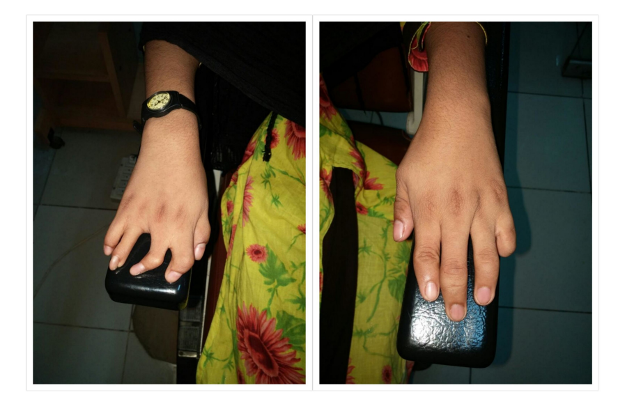
FIGURE 4: Musculoskeletal anomalies released syndactyly in right hand, auto-amputation of little finger in left hand, and brachydactyly in both hands.