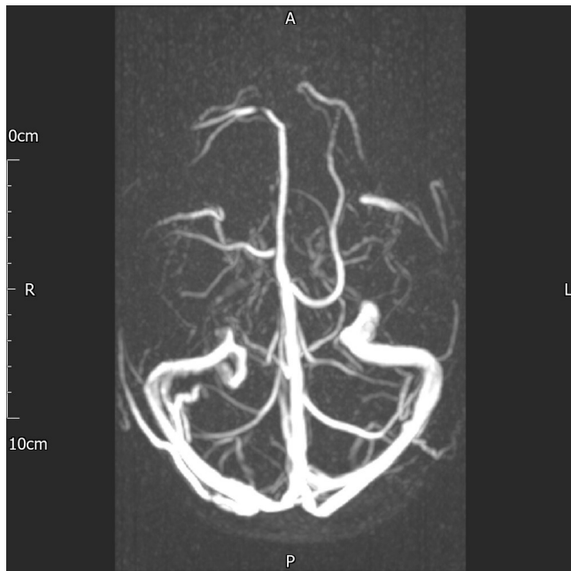
Figure 1 MRI-venogram: highlighted clear patency of cerebral vessels. A, anterior; P, posterior.

Further cross-sectional imaging via a MRI-venogram (figure 1) confirmed no evidence of a cerebral or dural thrombosis. Fundoscopy examination was normal. A lumbar puncture was muted, but not performed, considering her profound thrombocytopenia.