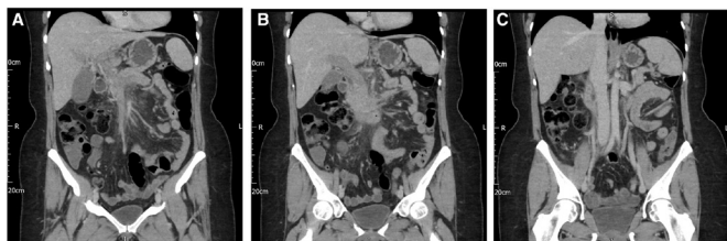
Figure 4 CT triple phase liver: coronal images showing (A) dilated portal vein with complete thrombosis in the main branch, (B) splenic vein thrombosis and (C) normal appearing IVC and normal patency of the hepatic veins IVC, inferior vena cava.

pulmonary vessels after the AstraZeneca vaccine (ChAdOx1 nCoV-19).