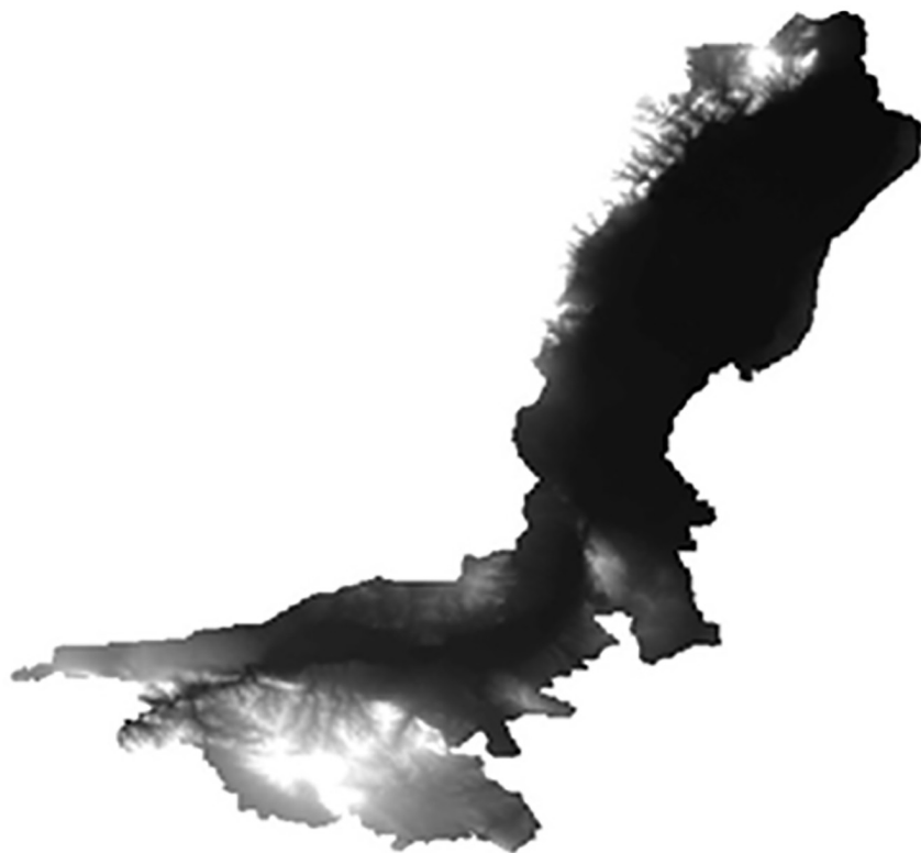
Fig 1. DEM map of Ningxia section of the Yellow River Basin.

The high-resolution DEM data (SRTM: Shuttle Radar Topography Mission 90-meter resolution data) employed in this study are available in the Chinese Academy of Sciences' ( http://datamirror.csdb.cn/index.jsp ). International Scientific Data Service Platform and modified to meet this study needs (Fig 1). (Republished from [Institute of Geographic Sciences and Natural Resources Research of Chinese Academy of Sciences] under a CC BY license, with permission