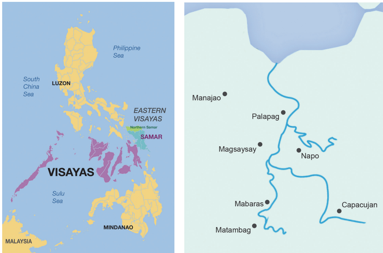
Figure 2. Map of the Philippines showing Northern Samar province highlighted green (Left). Map of the municipality of Palapag, showing barangay locations and rivers (Right). [48]