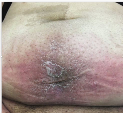
Fig. 1. Gross view of abdominal wall on presentation.

from immediately anterior to the sigmoid colon through the abdominal wall (Fig. 2a). There was suspicion of involvement of the small bowel and the superior urinary bladder.