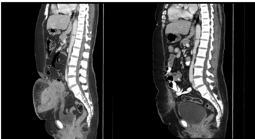
Fig. 2. 2a: CT image of patient at initial presentation. 2b: CT image of patient after three cycles of chemotherapy but prior to surgical resection.

consistent with metastatic squamous cell carcinoma. She underwent treatment with weekly cisplatin and concurrent radiation to the whole pelvis and inguinal regions. At the time of the writing of this manuscript, she was without evidence of disease for 18 months following chemoradiation and was still in remission.