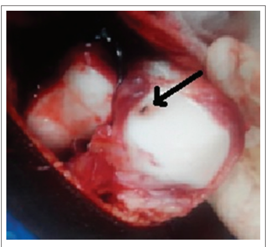
Figure 2: Black colored foreign body on eversion of patella [marked].