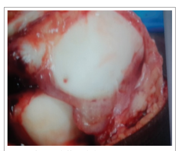
Figure 3: After removal of foreign body.