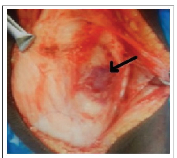
Figure 4: Retrospective examination of anterior aspect of patella showing granulation tissue [marked] "Double Inspection."

The knee was immobilized in tube slab for 5 days and later started on continuous passive mobilization of knee according to pain tolerance. Culture and sensitivity were negative, histopathological report showed nonspecific synovitis. 1 week of intravenous antibiotics augmentin 30 mg/kg body weight/day (combination of amoxicillin and clavulanate potassium) with metronidazole 30 mg/kg/day, the kid responded well and got discharged with oral antibiotics (augmentin 375 mg a combination of amoxicillin and clavulanate potassium) for next 4 weeks. Complete range of motion was achieved by 6 weeks. At the end of 1 year follow-up he is completely asymptomatic, performing all his normal routine activities with no residual deformity or recurrence of any infection.