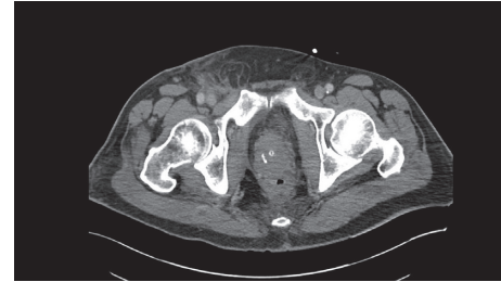
FIGURE 4: Postdrainage resolution of perirectal collection.

under anesthesia revealed anastomotic defect extending about 1.5 proximally. The abscess cavity was suctioned out via this defect, and a 26-French Malecot drain was placed in the cavity transanally. The drain was then secured to perianal skin via two nylon sutures.