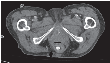
FIGURE 2: CT on day 7 after drainage demonstrating resolution of abscess with transanal drain in place.