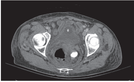
FIGURE 1: Perirectal fluid collection with contrast in the rectal lumen.