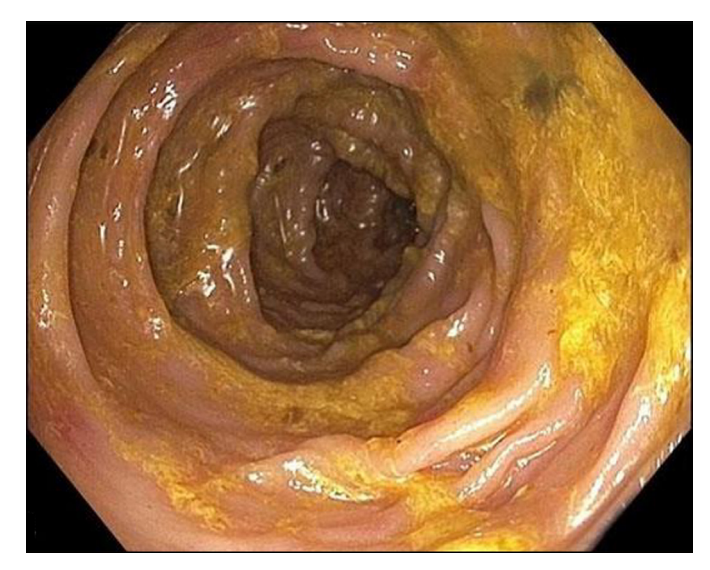
Figure 1. Flexible sigmoidoscopy revealing erythematous mucosa in the sigmoid colon and no evident ulcers. The sigmoid mucosal view is limited by poor preparation prior to the procedure.

lgbinedion et al Ganciclovir-Resistant CMV Colitis