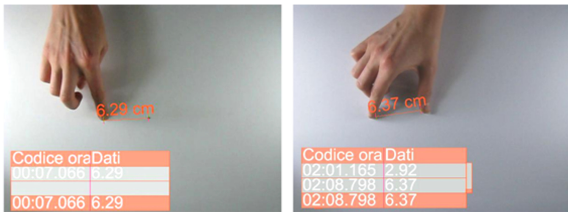
Figure 3 Data resulting from video analysis in a pointing and in a grasping task.

Statistical analysis was not conducted because subjects made no errors during this task.