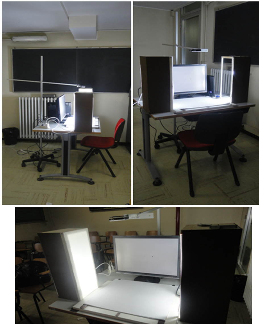
Figure 1 The setting.

increments marked on it placed on the shelf, to correct any possible distortion in the recorded video.