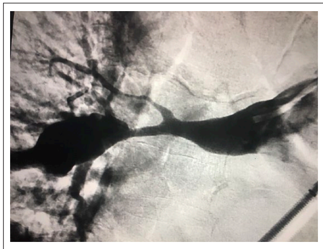
Figure 2. Selective right pulmonary artery baseline angiogram.

marked reduction in blood flow to the right lung (Figure 1). Echocardiography demonstrated normal left ventricular (LV) function, moderate tricuspid regurgitation and estimated PA pressure of 62 mmHg. To minimize the risk of PA rupture, we planned to use the Viabahn BX balloon-expandable covered stent (W.L. Gore & Associates, Inc., Flagstaff, AZ) as definitive treatment. Due to the risk of post-procedure pulmonary edema, the patient was electively intubated prior to the procedure. An 8F 90 cm sheath (Pinnacle Destination, Terumo Medical Corp., Somerset, NJ) was advanced from the right common femoral vein to the main PA. A 7F AL-1 coronary guide catheter (Cordis/Cardinal Health, Inc., Dublin, OH) was used for selective angiography (Figure 2) and to advance a 0.018 V18 wire (Boston Scientific, Inc., Marlborough, MA) to the distal right PA. Systemic anticoagulation was achieved with intravenous heparin. The right PA was then studied with intravascular ultrasound imaging (Visions PV, Philips N.V., Amsterdam,