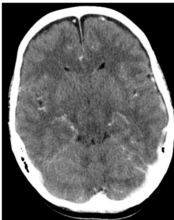
Figure 1 Computed tomography scan of head.

The CT head scan revealed bilateral areas of low attenuation in the left occipital lobe and to a lesser extent in the right occipital lobe. There were also some patchy areas of