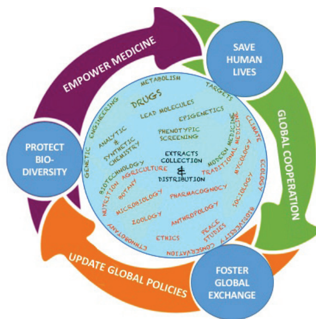
Figure 1. Schematic representation of the global and interdisciplinary nature of our proposal. Names of the selected research subjects to be included in our consortium are indicated over the globe/map of the world in the shape of 'Tao', with disciplines being distributed according to their relation to each other, in the context of our initiative, to form two large interconnected groups 'Global South' and 'Global North', characteristic by overall tendency to 'biodiversity and traditional knowledge' and 'technology and modern knowledge', respectively. The metaphorical relation to the ancient and modern Chinese symbol of 'Tao' is demonstrating the holistic or 'non-dualistic' approach to the solution to biodiversity and biomedicine problems, requiring acknowledgement and cooperation of bigger scientific community in order to promote mutually beneficial co-existence of humankind with other species.

In conclusion, it is crucial that governments, global organizations, and local stakeholders come together to agree on preservation of remaining hotspots of biodiversity through development of partnerships. Activities should include the collation and generation of knowledge about the regions and their species' potentials and provide education and collaborative outreach to local governments, decision makers, and stakeholders.