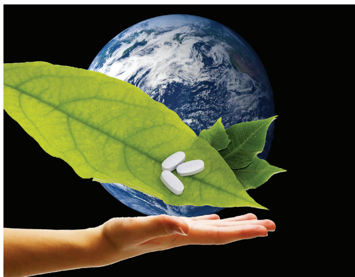
Photo: Illustration created by Milica Pešić using CC0 Creative Commons images (no attribution required).

Sound ethical oversight and responsible policy implementation needs to accompany exploration of medicinal species, whether bacteria, fungi, plants or