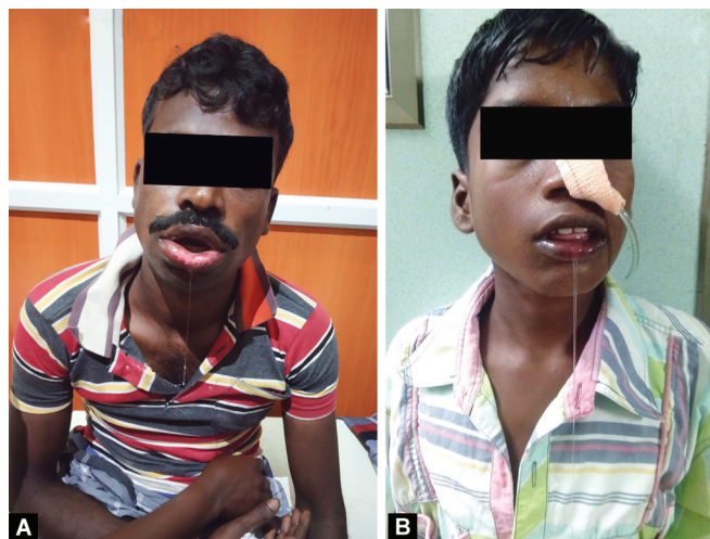
Figs 1A and B: Angioedema in patients who consumed Typhonium trilobatum tuber: (A) Case 1; (B) Case 4