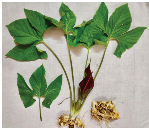
Fig. 2: Typhonium trilobatum plant with tubers

The genus Typhonium belongs to the Araceae family, which is native to southern Asia and Australia. Typhonium trilobatum (Bengal Arum, Lobed Leaf Typhonium) is an aroid growing in wooden areas across