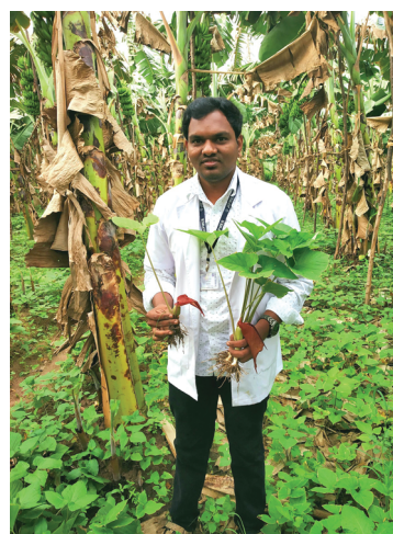
Fig. 3: Corresponding author collected the wild tuber plants which caused the toxicity in humans