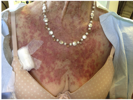
Fig 1. Erythematous, papulosquamous changes on the patient's chest after her second weekly dose of gemcitabine (case 1).

resolved over the next 3 months; however, both the ANA titer (1:320) and SS-A titer (>8) remained elevated. Interestingly, the SS-B titer declined to 1.2.