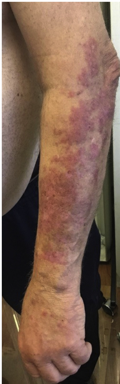
Fig 3. Psoriasiform papules coalescing into plaques on the forearm (case 2).

through induction of apoptosis, leading to nucleosome release, which then act as target antigens and induce an autoimmune response. 7 Gemcitabine is a nucleoside analog that leads to apoptosis through