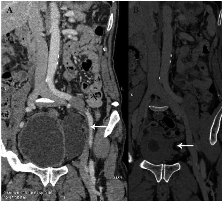
Figure 2. Representative computed tomography (CT) images of a 71-year-old male patient that presented with recurrent oedema of the left lower extremity for 6 years: (a) contrast-enhanced CT of the abdomen and pelvis showed a massive diverticulum of the bladder that resulted in severe compression of the left iliac vein (white arrow) and (b) CT re-examination indicated that the bladder diverticulum was obviously retracted and there was no compression of the left iliac vein (white arrow).

[All Fields] OR “urinary bladder”[MeSH Terms] OR (“urinary”[All Fields] AND “bladder”[All Fields]) OR “urinary bladder”[All Fields] OR “bladder”[All Fields] OR “bladders”[All Fields]) AND (“diverticulae”[All Fields] OR “diverticula”[All Fields] OR “diverticulum”[MeSH Terms] OR “diverticulum”[All Fields] OR “diverticula”[All Fields])) OR (“vesical”[All Fields] OR “vesicals”[All Fields]) AND (“diverticulum”[MeSH Terms] OR “diverticulum”[All Fields] OR “diverticulums” [All Fields])) AND (“veins”[MeSH Terms] OR “veins”[All Fields] OR “venous”[All Fields] OR