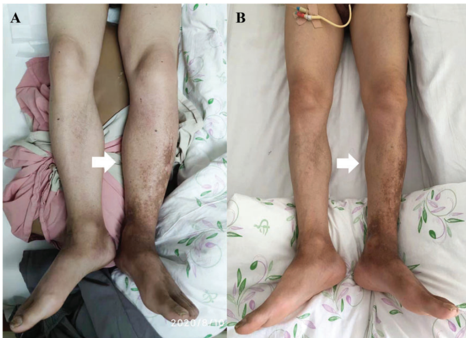
Figure 1. Representative photographs of a 71-year-old male patient that presented with recurrent oedema of the left lower extremity for 6 years: (a) On admission, the patient had significant left lower limb oedema (white arrow) and (b) Three days after indwelling of the urinary catheter, oedema of the left lower limb subsided (white arrow). The colour version of this figure is available at: http://imr.sagepub.com .

In October 2020, a 71-year-old male patient was transferred to the Department of Vascular Surgery, Beijing Friendship Hospital Affiliated to Capital Medical University, Beijing, China due to recurrent oedema of the left lower extremity for 6 years (Figure 1a). The patient had a 20-year history of benign prostatic hyperplasia and had recurrent dysuria and urinary incontinence in the past 6 years. Typically, each time this patient developed urinary incontinence, left lower limb oedema also occurred. After 4-7 days, with the gradual improvement of urinary incontinence, leg oedema also gradually eased. However, this time, the patient's urinary incontinence lasted for 20 days and the