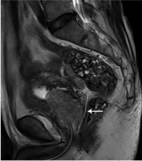
Figure 3. Magnetic resonance imaging of the prostate of a 71-year-old male patient that presented with recurrent oedema of the left lower extremity for 6 years showed that the prostate was significantly enlarged and partially protruded into the bladder (white arrow).

the full text was not available. Four studies were finally retrieved in full and cross-reference searches were performed. 4-7 Finally, a total of five cases, including the current case, were reviewed. The process was completed by two investigators (X.B.W. & X.G.) that first determined the search terms and screened the retrieved literature. If necessary, the authors were contacted by email or telephone to obtain information not identified in the literature but meaningful to this study. When disagreement occurred, the superior physician (H.F.) was consulted for further clarification.