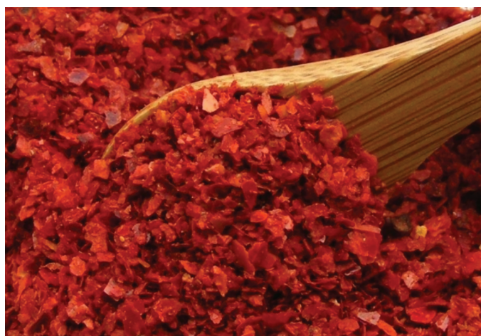
Figure 2. Pepper in Turkey—a substantial source of sodium

Hypertensive or not, there is no doubt that overall salt consumption is too high in Turkey. It is off the chart compared with that in most other countries. Surprisingly, in limited surveys, stroke rates are only moderately increased in Turkey, perhaps