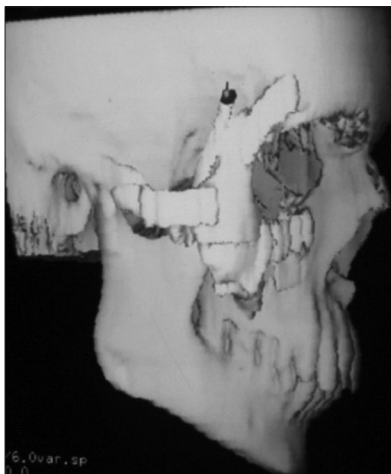
Figure 8: Post-operative CT scan