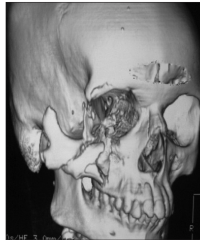
Figure 4: Pre-operative CT scan