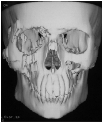
Figure 7: Post-operative CT scan