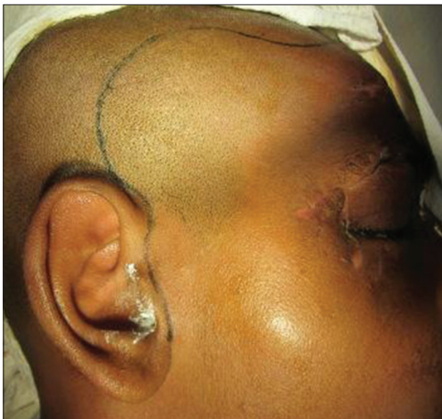
Figure 5: Intra-operative photograph of patient