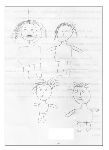
Figure 2: The portrayal of emotional and psychological disturbance

Most of the children at the hospital were found with their mothers while there were only few cases, where either father or both the parents accompanied the child. There were few drawings where children drew single parent accompanying them, while few of the drawings showcased the portrayal of detachment from both their parents; however, only three children drew complete family on the paper.