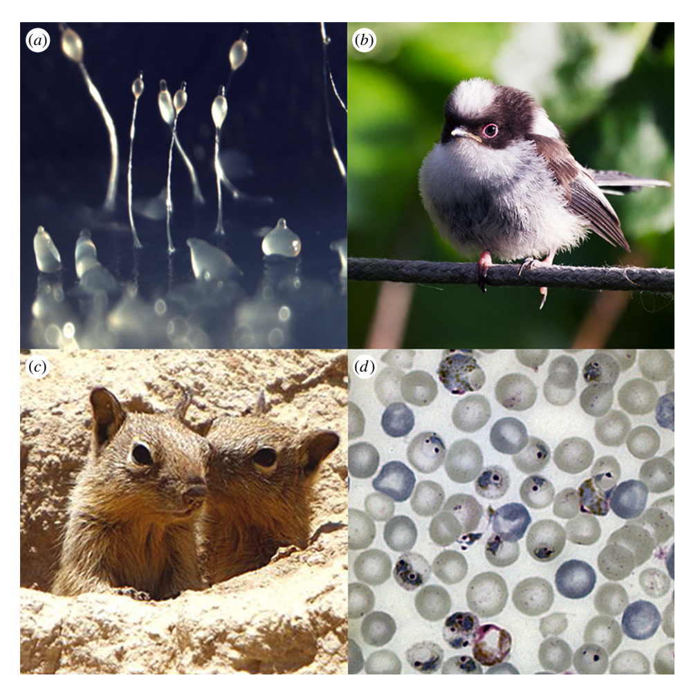
Figure 1. Examples of kin discrimination by: (a) direct recognition, e.g. cells of the slime mould Dictyostelium determine whether they are interacting with kin or non-relatives during slug and spore formation based on the sequence similarity of their surface adhesion proteins [66,67]; (b) indirect cues based on familiarity with individuals, e.g. long-tailed tits learn the vocalization patterns of kin during the natal rearing period [68] or (c) 'armpits' which are a mixture of direct and indirect cues, e.g. ground squirrels use olfactory cues which have a genetic component and are also learnt by selfreferencing during development [69]. The malaria parasite, Plasmodium chabaudi (d), adjusts investment into male and female transmission stages according to how many other conspecific clones share the host, suggesting kin discrimination occurs [21]. The mechanism is unknown but indirect cues seems unlikely; an obvious candidate would be that parasites can infer the presence of other clones via the host immune response, but sex ratio adjustment is observed in infections before the required strain-specific responses develop.

only direct help to individuals expressing that gene—a notion popularized as a 'green beard' [64,65]. Another way to direct cooperative behaviours towards appropriate recipients is through the ability to recognize kin (figure 1). Kin discrimination can occur via: (i) direct recognition, (ii) indirect cues that convey whether a recipient is likely to be a relative; or (iii) a mixture of direct and indirect information. Kin discrimination systems can require additional selective forces to maintain polymorphisms that can be used as accurate identifiers [70]. Host-parasite systems, in which genotype-bygenotype interactions and frequency-dependent selection maintain genetic variation, are candidate motors maintaining the genetic diversity required for kin discrimination (figure 1).