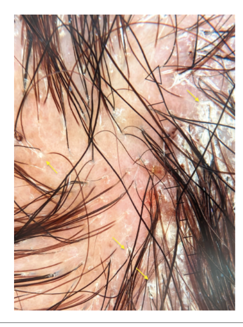
Figure 2. Dermoscopy with a liquid interface of the alopecic patch showed perifollicular scale (yellow arrow) and thin, pearly white striae arranged in a reticular configuration, suggestive for Wickham striae. Note the coexistence of scratch-induced erosion in the middle part.

Dermoscopy detected reticular white lines at the proximal nail fold, congruent with WS (Figure 3). An oral biopsy was performed, showing hyperkeratosis, mild epithelial acanthosis, a lichenoid band-like infiltrate in the submucosa, and vacuolization of the basal