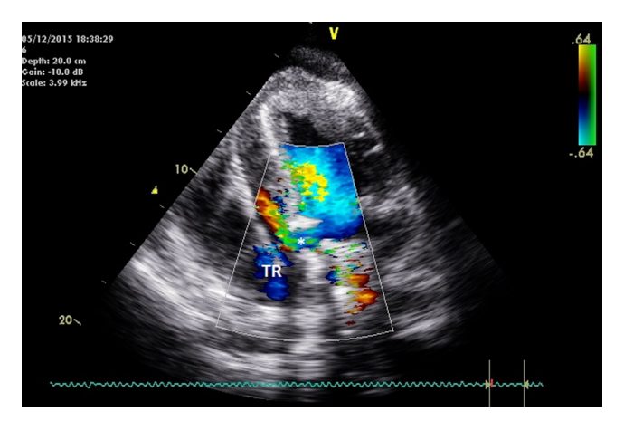
Fig. 2. Color wave Echocardiographic image shows left-right shunt through iatrogenic ventricular septal defect.