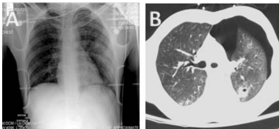
Figure 3 AP chest X-ray of the intubated patient, illustrating diffuse air space opacities in the left lower lung field (Panel A). Underlying pneumothorax was suggested because of a visible pleural stripe in the lung apex and a visible cardiophrenic sulcus. Chest CT scan illustrating a left-sided pneumothorax with underlying lung collapse (Panel B).

has some disadvantages, including the need for patient transportation (which is not usually feasible in the unstable patient) and high doses of radiation. Lung ultrasonography has emerged in the past decade as a new and sensitive technique in the evaluation of respiratory diseases with a sensitivity of detecting pneumothoraces ranging from 92% to 100% among patients with blunt injuries [22-25]. Other advantages include the fact that it can be easily and quickly performed at bedside by a wide range of “sonographers,” such as trauma, emergency, and critical care physicians [25]. The possible role played by chest ultrasonography in detecting the size and extension of a PTX is a challenging task which would allow the emergency department physician to take interventional decisions, such as the positioning of a chest tube, without wasting time. Potential pitfalls for thoracic ultrasonography such as the presence of pleural adhesions and emphysematous bullae